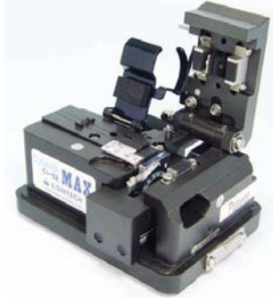
CI-02 without sharps bin